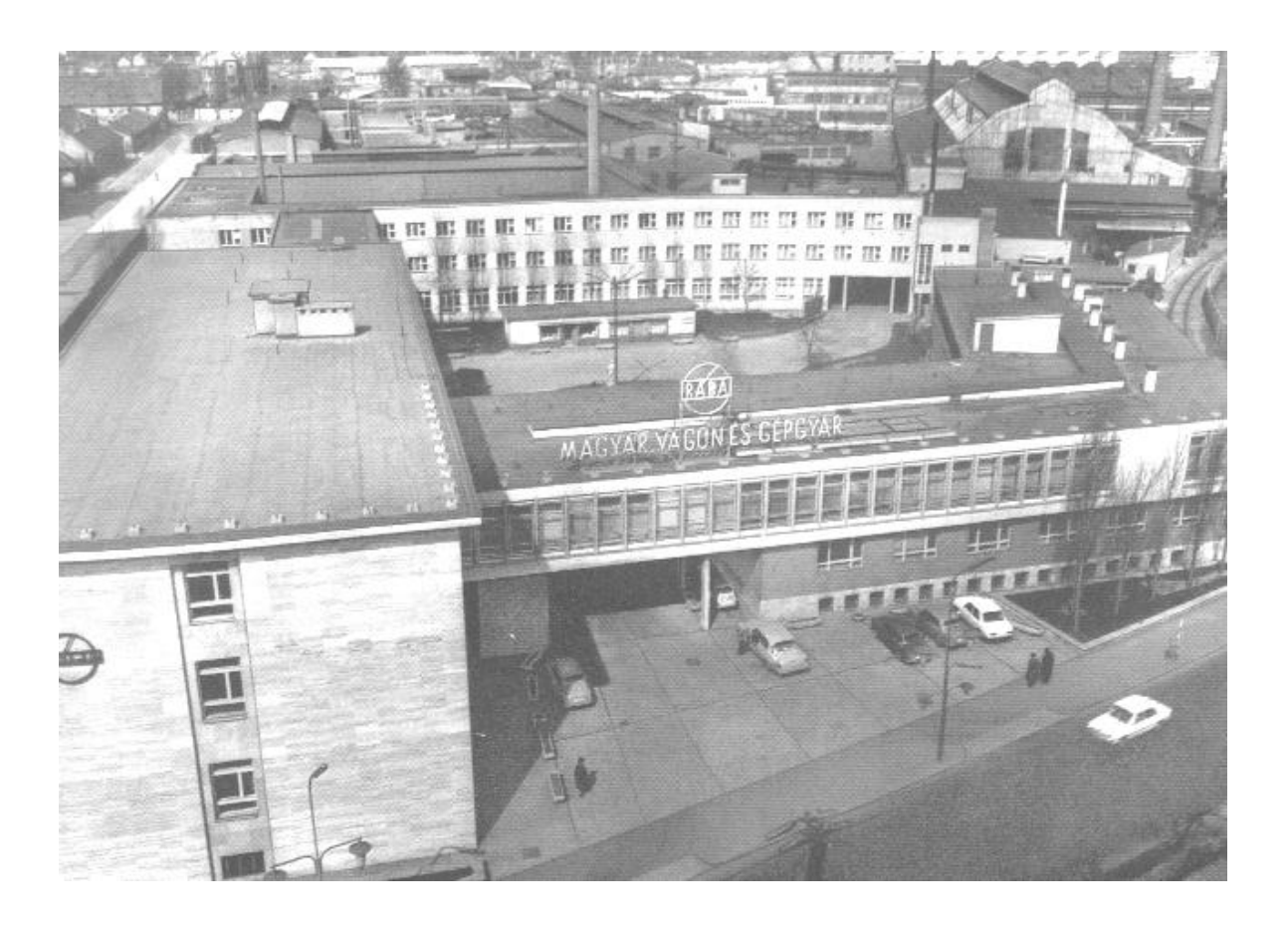
Figure 4. The headquarter of Rába MVG