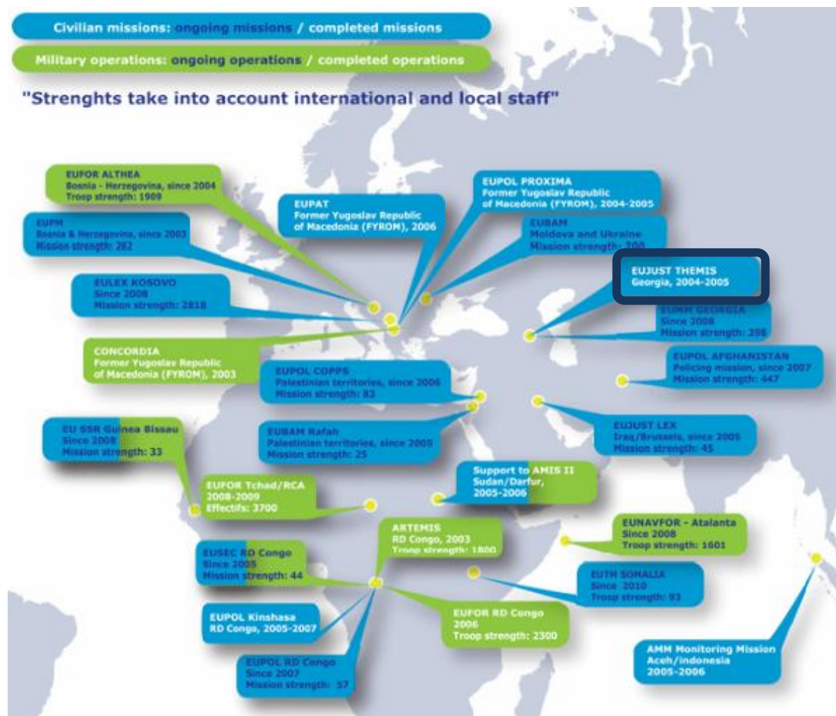
Figure 2: EU Missions worldwide, as of May 2010