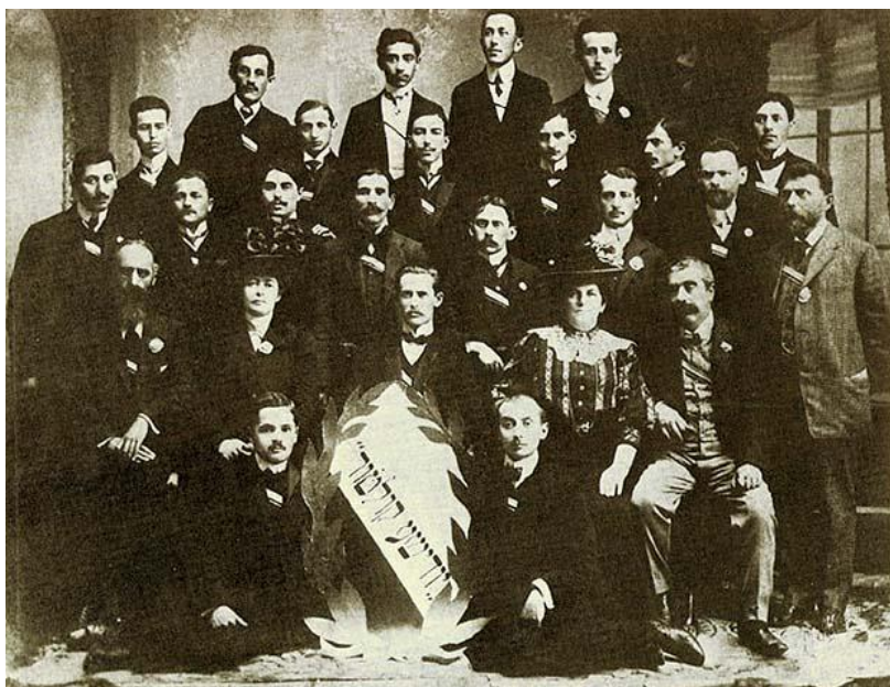
Fig. 1. Photo of the Conference participants with members of organization Jüdische Kultur

The Conference was the first international, interparty conference to deal with the role of the Yiddish language in Jewish life. It was held from August 30th to September 4th, 1908, in the biggest Jewish centre of Austria-Hungary, Czernowitz. All together, from seventy to one hundred delegates were present at the Conference, among which there were politicians and cultural activists such as Nathan Brinbaum, dramatists Jacob Gordin and David Pinski, publishers A.M.Evalenko, Haim Zhitlovskiy and Yiddish writers such as I.L. Peretz, A.Reizen, Sholem Ash, and many others (see fig. 1 below).