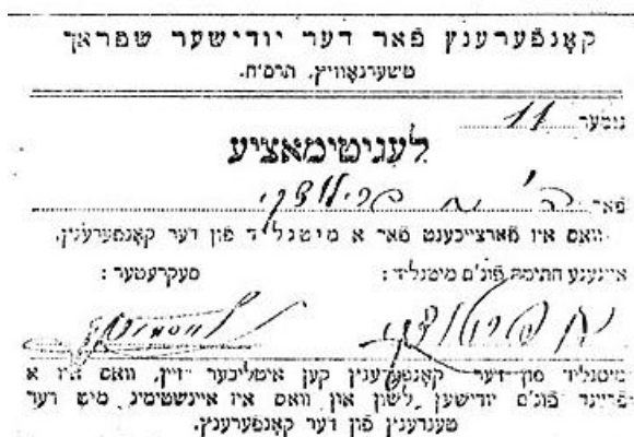
Fig.2. Mandate of the Conference participant

and personal ambitions of Nathan Birnbaum,” 108 who, paradoxically, was not fluent in Yiddish and delivered his speech in German. 109