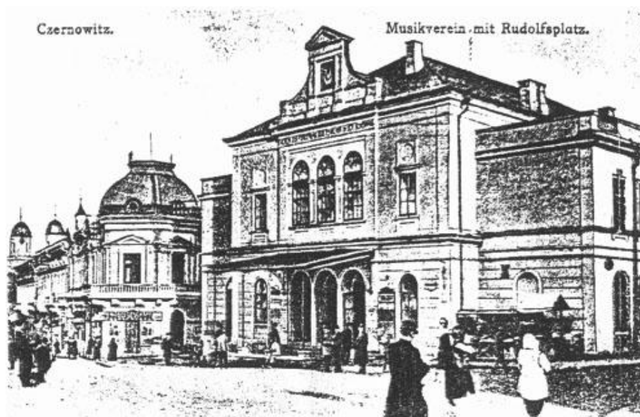
Fig. 6. Czernowitz Music Society (Postcard, 1908)

Also the Conference was used for some personal interests: some Russian Jewish politicians used it as an occasion to emigrate from Russia (where after the unsuccessful revolutionary activity there were restrictions on political and social activity). Thus, the leader of Poale Zion, Leon Hasanovich, together with Ber Borohov moved to L'viv (in 1908) and then to Vienna (between 1913 and 1919). 125 Another person who used the Conference in order to escape from Russia was one of the few famous female Jewish political leader's, Ester Frumkin. After several times being imprisoned in Russia, she left Russia and in Czernowitz organized a "Jewish Social-Democratic Party."