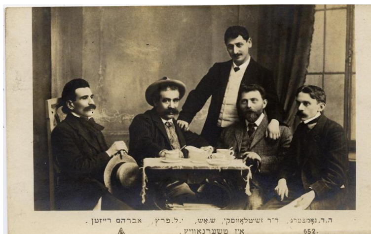
Fig. 4. Photo of L-R: H.D. Nomberg, Haim Zhitlovsky, Shalom Ash, I.L. Peretz, A. Reisen at the Czernowitz Conference (1908)

Moreover, at the Conference were present representatives of the following local and foreign newspapers: Czernowitzer Tagblatt , Allgemeine Zeitung , Bukowinaer Post , Die Zeit (Vienna), Die Welt (Köln), Jüdisches Tagblatt , Jüdischer Arbeiter , Sozialdemokrat (Lemberg), Jüdische Zeitung (Vienna), Unser Leben (Warsaw), Hed Hasman (Vilnius), Der Fraind (Petersburg), New-Yorker Tagblatt (New-York). 116