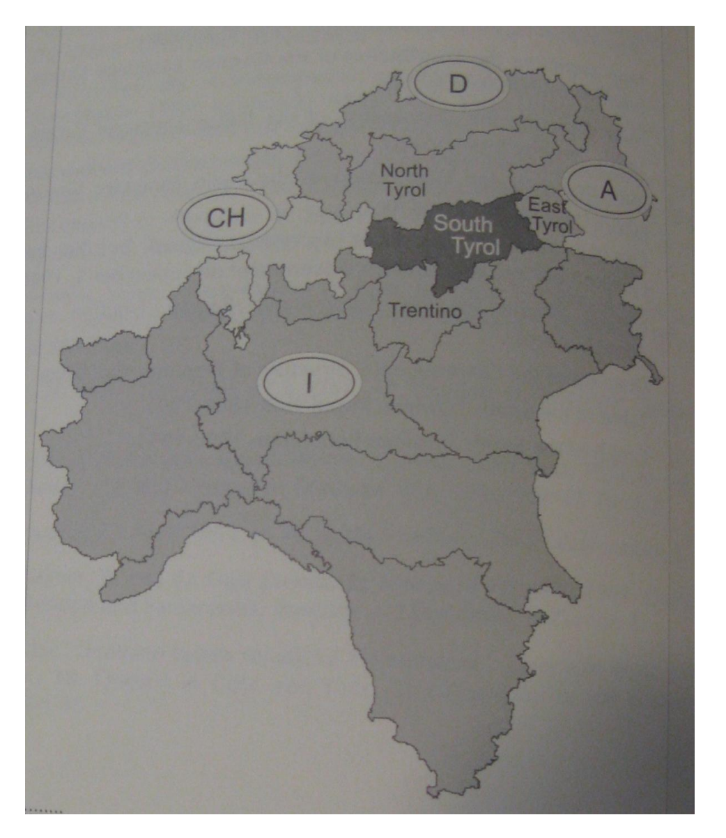
Source: Magliana, Melissa. The Autonomous Province of South Tyrol. A Model of Self-Governance? Bolzano: European Academy of Bozen/Bolzano, 2000.