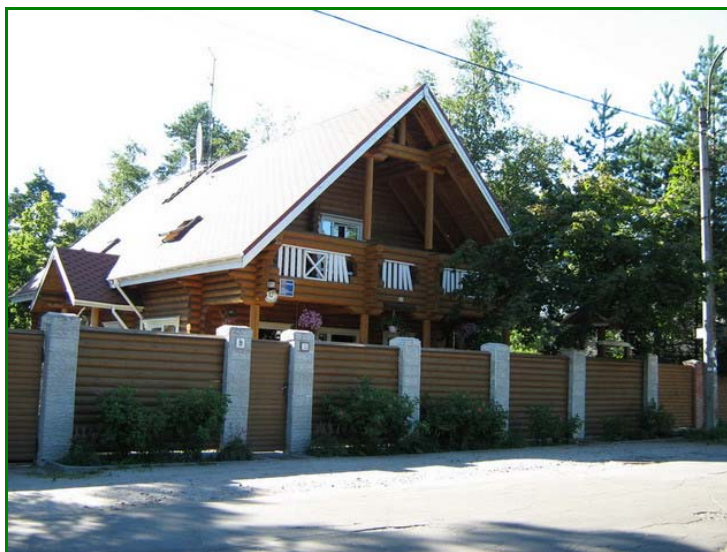
Figure 1. A “proper” dacha in an old dacha settlement near Saint Petersburg, recently rebuilt. 2007.

build “second houses” and to turn garden plots into proper dachas (see the Figures 1 and 2 for the differences preserved till now).