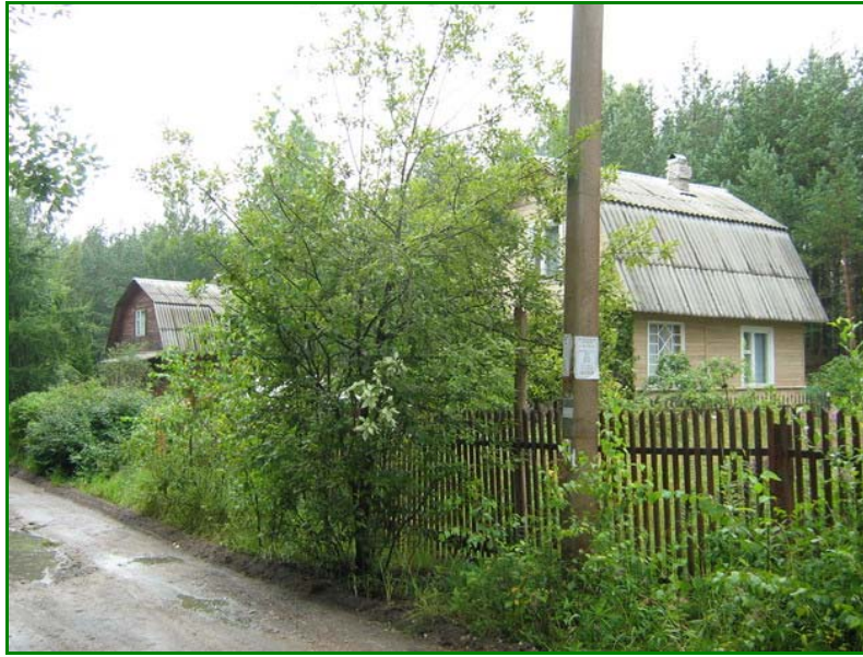
Figure 6. A transparent fence and greenery along the street.