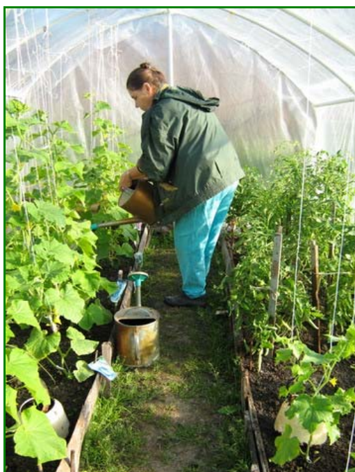
Figure 7. A typical outfit for a garden cooperative.

usually explained practically: people constantly work in their gardens, so any clothes are dirty very soon, and after days spent on the ground dirt is hard to wash off the skin (Interview 6). It also supports the regime of public privacy: people appear in public spaces such as streets, local roads or shops showing an exterior more suitable for private settings, not to mention such a quasi-private space as a garden around one's cottage, which is often more or less transparent for a passer-by, while the requirements for appearance there are even more relaxed (Interview 2; Interview 12, etc).