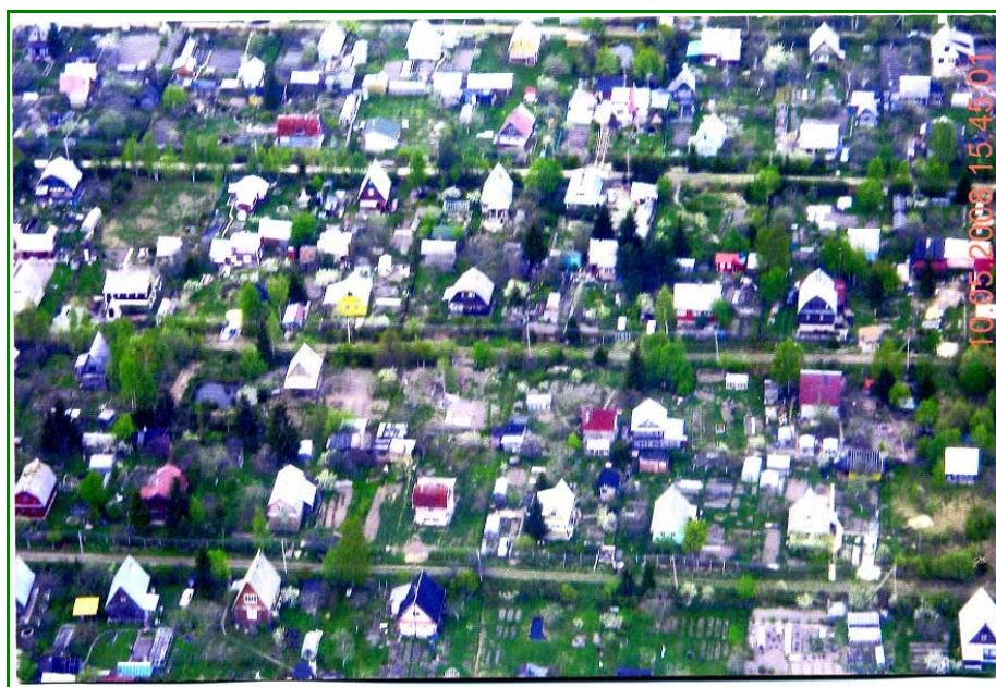
Figure 3. The garden cooperative, 600m 2 garden plots lie in two rows between the roads. View from a plane. The spring of 2008.

It is clear here that for this old man desirable privacy means not only hiding his personal life from collective scrutiny, but his ownership right and control as well. Possession and control expressed with the phrase “one’s own” was distinguished by Gerasimova as an important “emic” category of privacy specific for Soviet communal apartments (Gerasimova 2002:225). I believe that it can be extended to garden cooperatives as well, partly due to the experience of communal life of many gardeners but mainly due to the features typical for all kinds of communal living in cramped conditions.