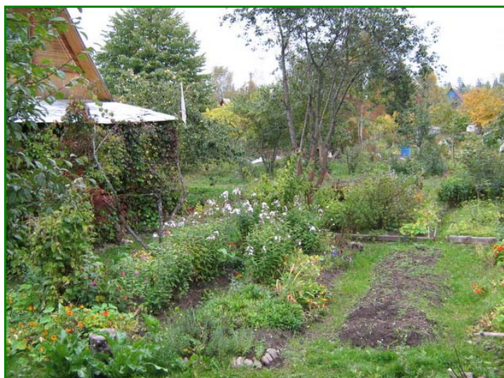
Figure 4. There is no fence between these two neighboring garden plots. The nearest trees and shrubs grow on the one garden plot, while the blue barrel behind belongs to the other.

distinguished by Kharkhordin (1997:350): private sphere hidden from the public eye as opposed to the open personal one was created through the means of dissimulation, so the suspicion about everything concealed was quite logical within that ideology. As I have mentioned in Chapter 1, Kharkhordin pointed out the opposite consequence of such a form of existence of privacy in Soviet times: according to him, it helped a certain part of Russian society to accept the value of privacy easily, because they had already had the experience of it (1999:357). I think the discrepancy is explained by the social differences between his informants and mine: he worked with the interviews of newly emerged businessmen of early 1990s, a social group, very different from an average garden cooperative member.