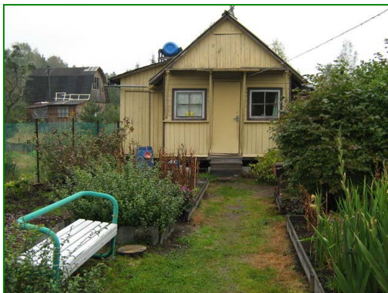
Figure 5. A transparent fence between the neighbors (left).

A fence is an important sign of more ordered and formalized relationships brought by the privatization as opposed to the chaos of the past, when precise borders and legal ownership rights were not so important because land was not subject to purchase and sale. The representatives of the individualist group would like both to enjoy the advantages of the new property regime and to preserve warm informal relationships in the neighborhood. The representatives of the second, collectivist group explicitly interpret fences as a sign of historical change: