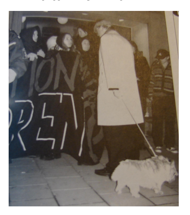
Anarchist feminists blocking entrance to a film festival, Stockholm, 1999

associated with anarchist feminism. These women were doing what one called "the important work" (meaning more "important" than lobbying politicians). Actions by these women included "throwing eggs" and protesting outside of sex clubs.