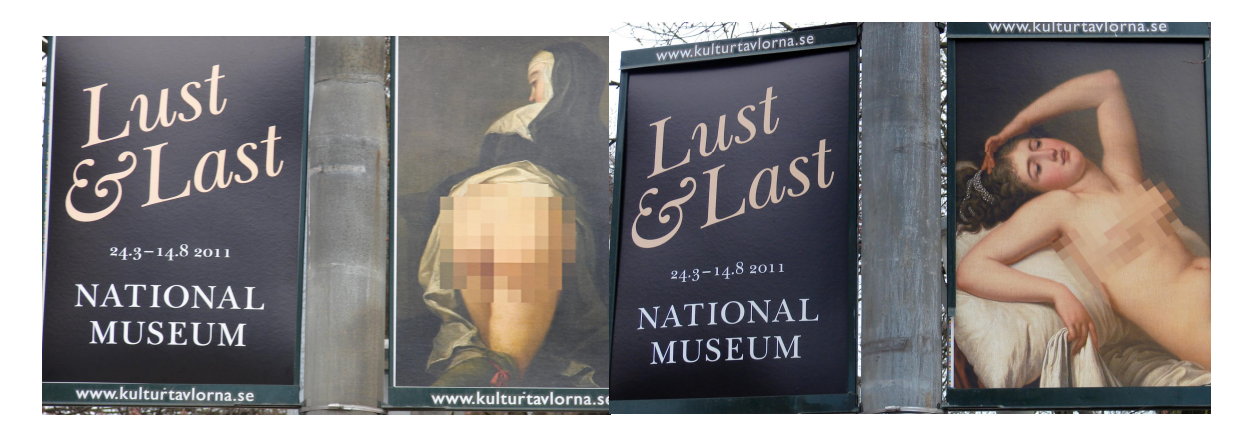
Author's own photos of flags near Odenplan.

philosophy, take the time to understand it, and consequently support it. In fact, it was quite obvious this wasn't the case in the way the national museum advertised its exhibit, Lust and Last , through the spring of 2011. Women's groups protested the exhibit saying the "lust" on display was a very specific kind. It was one in which men do the looking and lusting and women's bodies provide the objects to look at, much the way women provide bodies for prostituted sex. Objections formed over the government's sponsorship of the exhibit, especially a government that outwardly supported abolition. The museum responded by altering its advertisements: