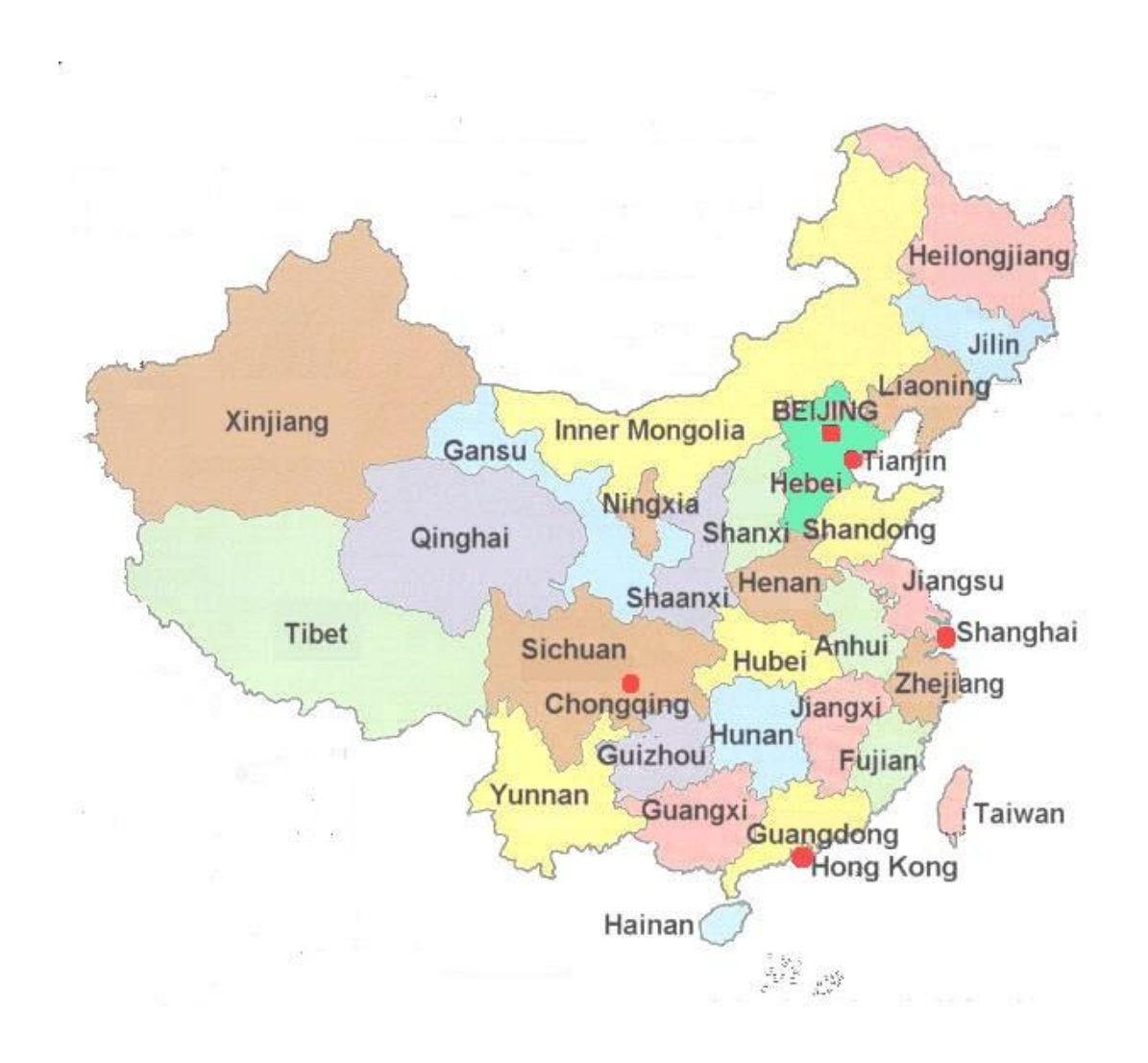
Map 1: Map of China (ChinaToday.com)