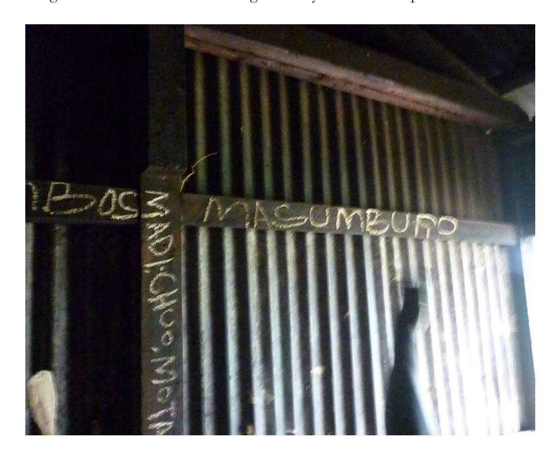
Figure 1: A house wall with writings in Manyani labour camp

Inscriptions on the wall: Boss, mad, college/university, suffering, motor