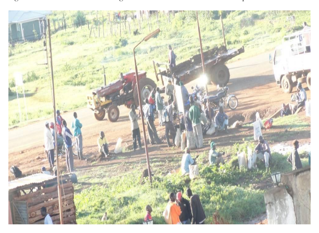
Figure 2: An aerial view of a morning scene at the casual labour recruitment point.

Note: Young men waiting to be picked for work that day. Over 60% return home everyday without working. The bundles they are carrying contain their tools and work clothes.