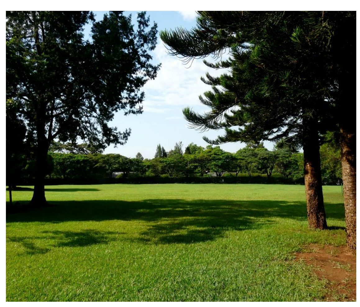
Figure 8: Lawn gardens around staff residences

To ensure the comfort of its management and support staff, the company has a comprehensive medical services facility, a state of the art gymnasium and the Sony complex primary and nursery schools which high standard facilities. These facilities in essence are meant