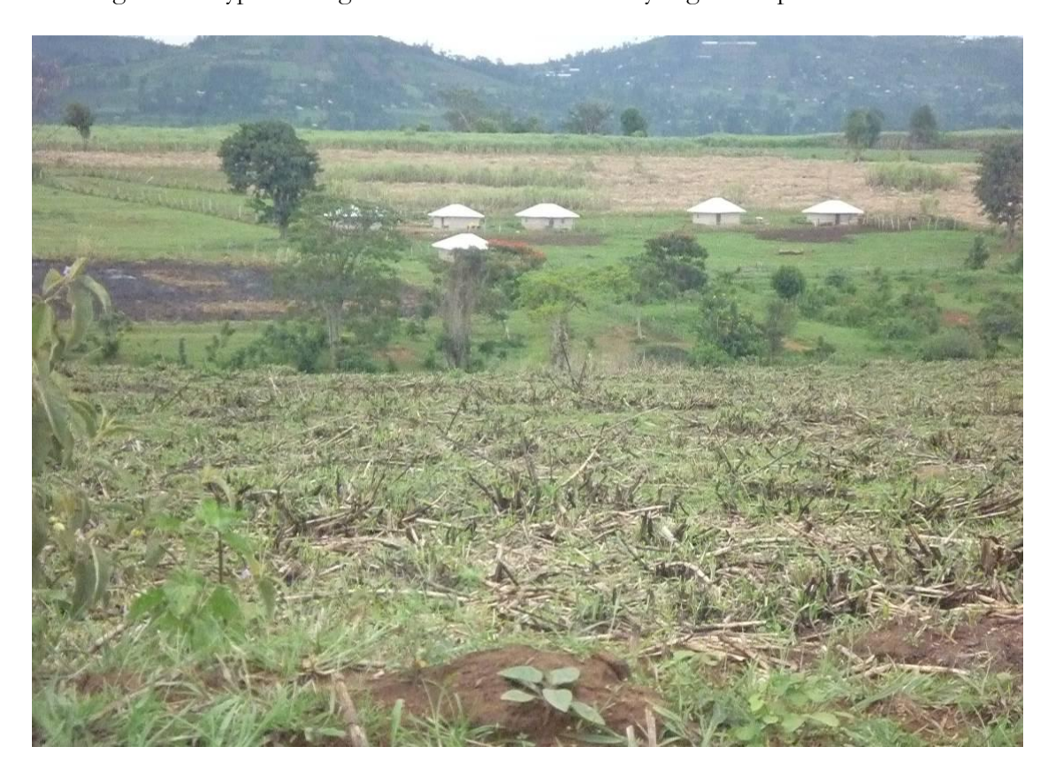
Figure 10: Typical village homestead surrounded by sugarcane plantations Mariwa.

The initial mapping of the Sony nucleus territory was not fully explained to the villages in the outskirts. To the villagers, the boundary was seen as a way of keeping them out of the development project. Many elders felt that they were being sidelined and left out hence made frantic efforts to ensure the boundary expanded to include them. According to Teresa and