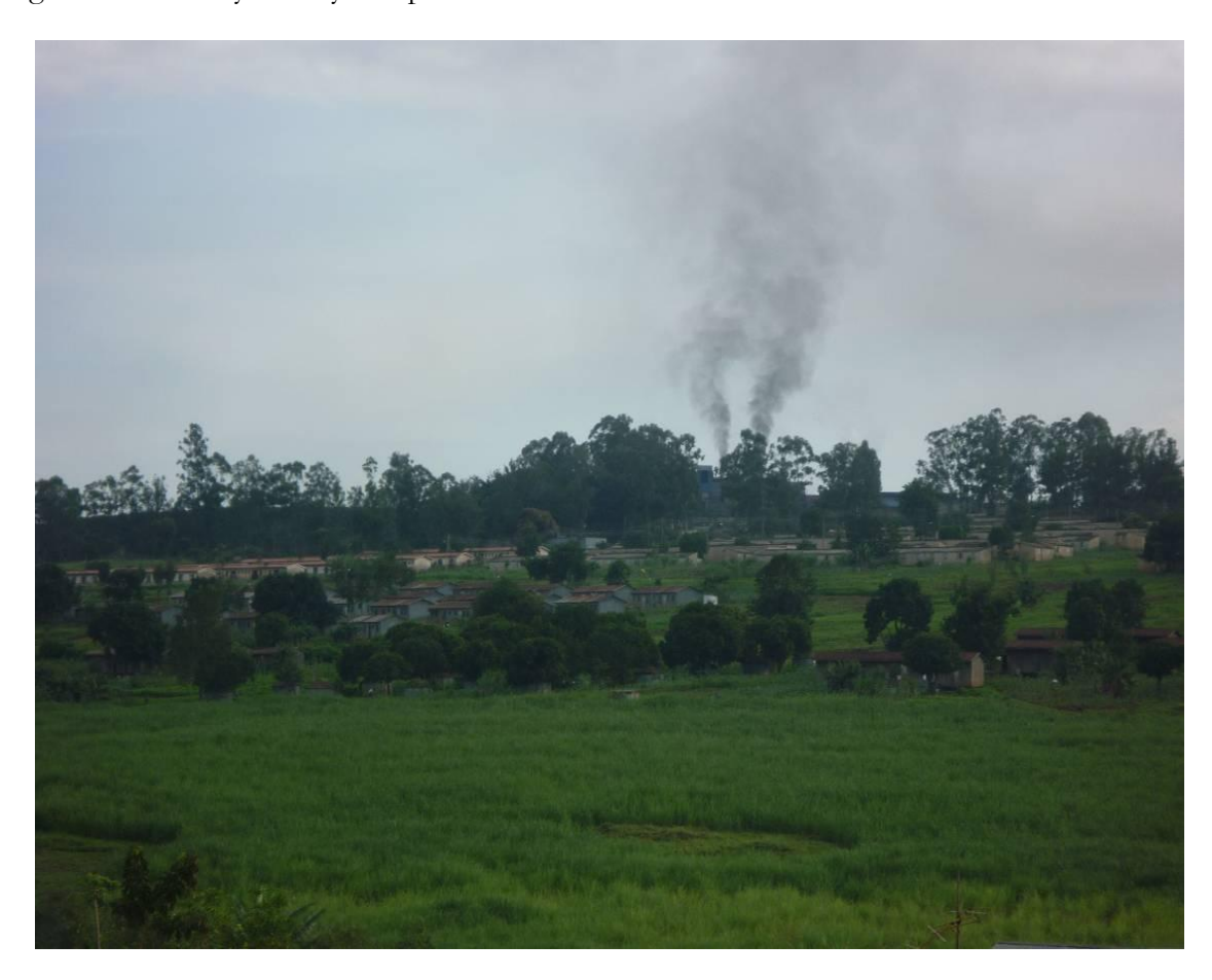
Figure 7: The Sony factory complex from a distance

In the administration block reside the general and executive management departments, finance and accounting and human resources. Ideally the human resource department should be the contact office for labourers but, as it clarifies, its mission is to attract, develop and maintain adequate, qualified and competent staffs through maximizing return on investments and thereby, reducing the financial risk arousal to the organization<sup>87</sup>. Given their temporality