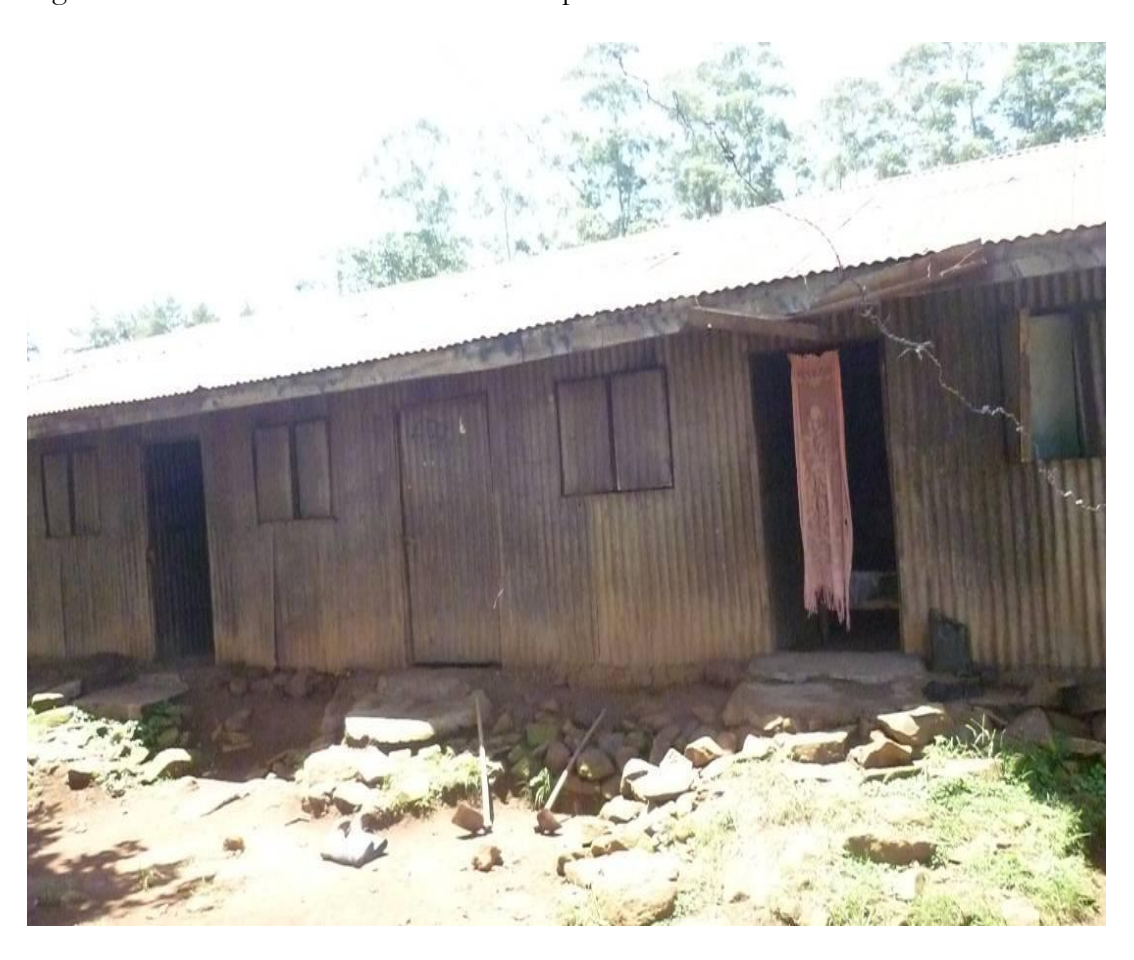
Figure 6: Row of houses at the labour camp

Juxtaposed with the construction of labourers as 'bulls' by the supervisors discussed earlier, the labour camp provides spatial liminality to explain the individual dislocation from the village to the factory on one hand and the transformation of rural young men into labourers. But structurally, it also shows how development while promoted as improvement, is instead dispossessive: capturing and appropriating local practices and social structures by and into new forms of rule (Joseph, 2010). The liminal quality provided a necessary ambiguity for the convergence of different forces of production and logics that formed the chaotic emergence of the plantation economy in Sony. The raw labour from the villages, the local