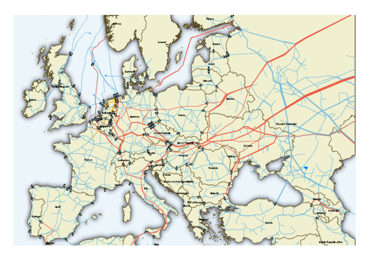
Figure 1 Natural gas pipeline network of the European Union