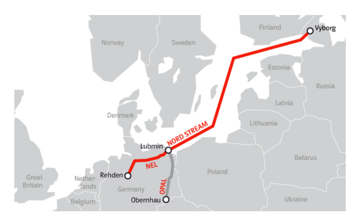
Figure 2 The route of the off-shore Nord Stream and its onshore extensions NEL and OPAL

Austrian/German border to the German/French border (MEGAL pipeline system) (European Commission 2011b, 3). OPAL, NEL and Gazelle pipelines are owned by separate entities.