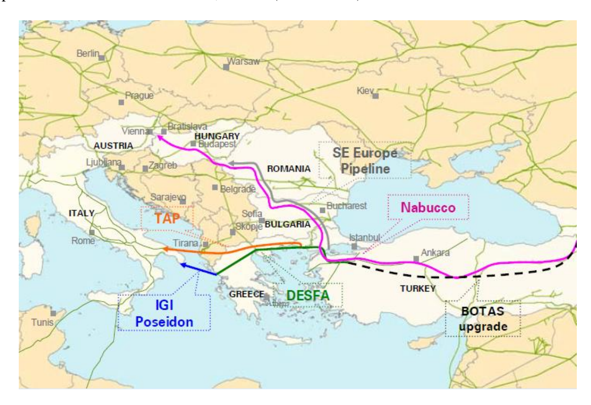
Figure 3 Possible Southern Corridor pipelines

Whatever the source of gas, the natural gas from the Caspian Sea would be transported onshore via the planned Southern Gas Corridor which is planned to bring Caspian natural gas to the EU through Turkey, Bulgaria, Hungary, Romania, and Austria and/or through Turkey, Greece and Italy (IHS CERA 2010). The whole route of pipelines from the Caspian sea to Europe is estimated to reach around 4,000 km (Tawse 2011).