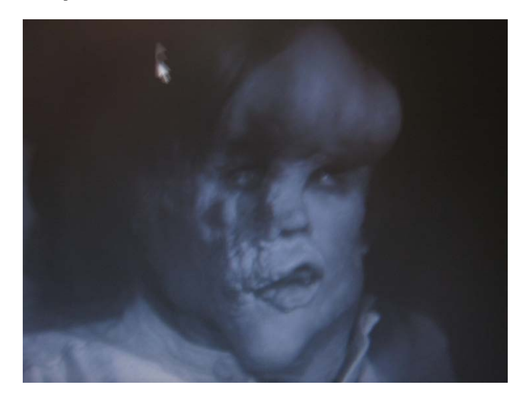
Figure 7: scene from The Elephant Man, directed by David Lynch

This does not mean that all art is functional but political-critical art certainly is. If for other arts (let's say "fine" arts as opposed to functional arts-even if I don't endorse this distinction) is difficult to identify their proper function this is not the case with political art. We identify political art as political art with respect to its function (otherwise, why calling it political art?). We can appreciate/evaluate individual instances of political art and reason how well they express (work out) their proper function. Political art is both functional and beautiful. Function does not nullify beauty. On the contrary, the fact that we know that a disharmonic feature is displayed in a piece of art with the purpose of rekindling our hearts makes that feature a beautiful one, even if it does not look so at first sight. Functionality informs (in the end) the way the object looks to us. X can look beautiful to us if we know that its function is to do something good and healthy. A horrifying face of someone suffering depicted in a movie is not pleasant to look at but looks beautiful to us once we know its purpose in that piece of art.