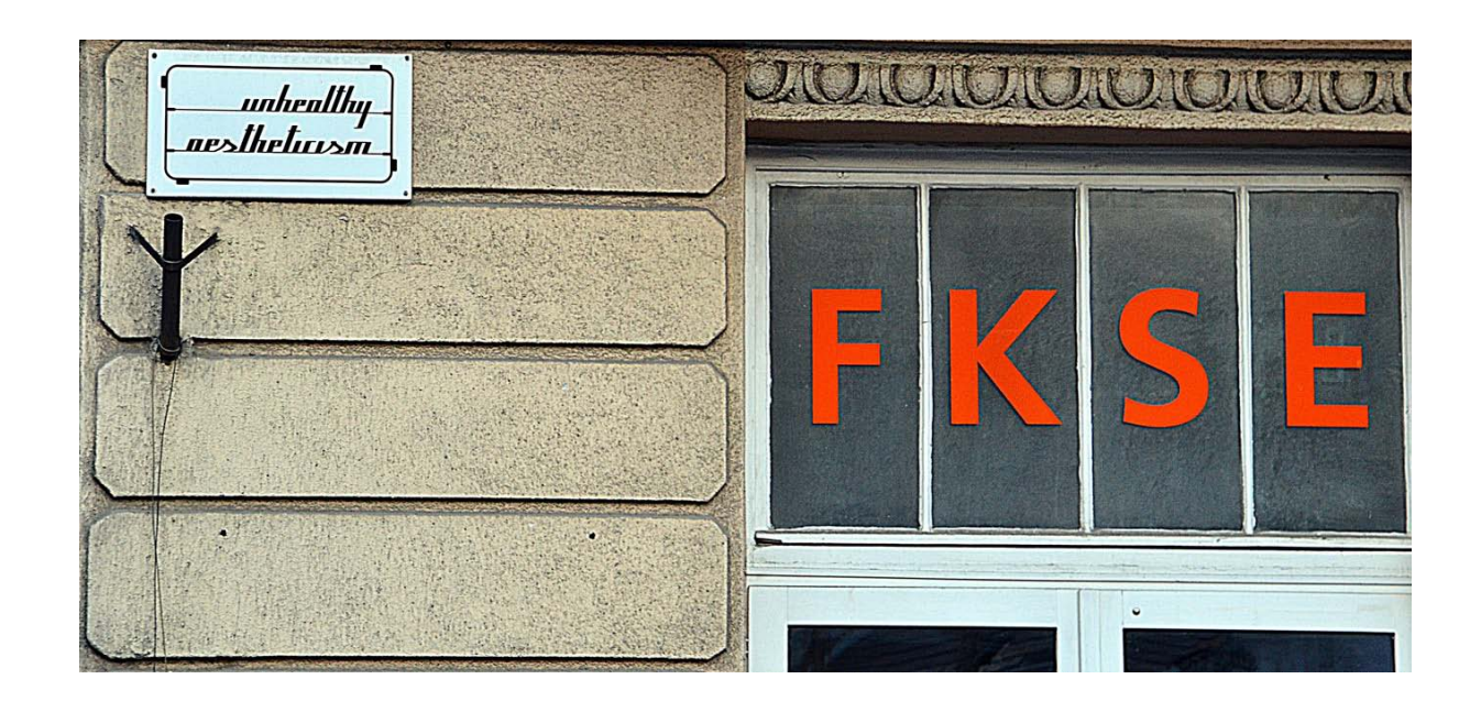
Figure 1. Unhealthy Aestheticism, Studio Gallery for Young Artists, Budapest, Hungary (this gallery is well-known for displaying critical art and for rejecting 'the aesthetic' as unhealthy)

"bourgeois" about the aesthetic (although aesthetic tastes may vary with social groupings). <sup>99</sup> There is nothing "bourgeois" about our "general capacity" to have aesthetic responses and make aesthetic judgments. What these judgments consist in and how are they contextually determined is another issue. As noted, I assume that these rejections of the aesthetic are based on a confusion (the aesthetic is identified with a certain, purist understanding of it) which has led these theorists to jettison the aesthetic from art's theory.