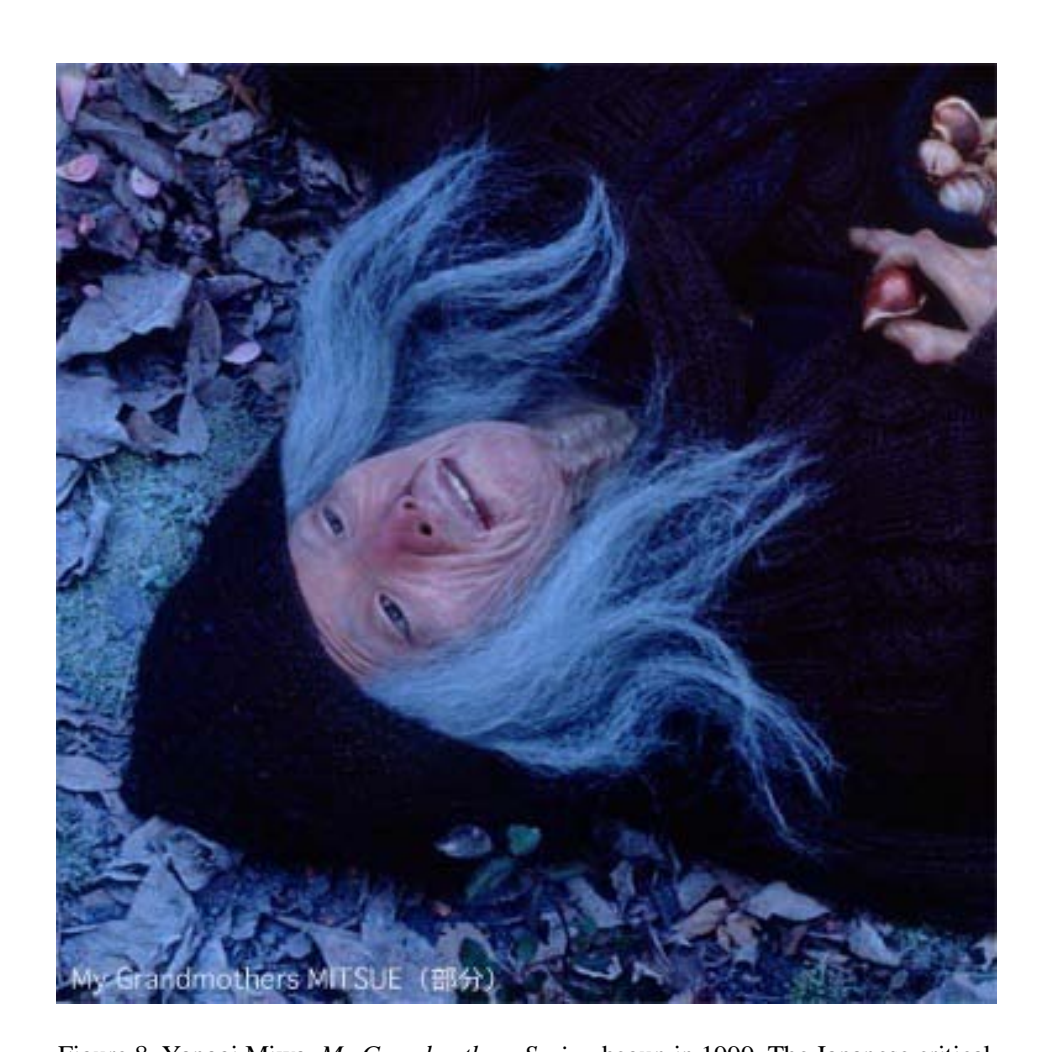
Figure 8. Yanagi Miwa, My Grandmothers Series , begun in 1999. The Japanese critical artist uses post-production photo editing, make-up, costumes and elements of décor to stage the great event of self perception and projection. The aim of this project is to critically examine and question the image of femininity and prettiness which happens to be the official norm in Japanese consumer culture. The beauty of these grandmothers rests in their willingness to express a personal opinion on the current state of affairs regardless of how old they get and how much their physical appearance declines.

examples of beauty (like the pig's snout). But, on the other hand, I see nothing unacceptable about that (neither for political art nor for beauty).