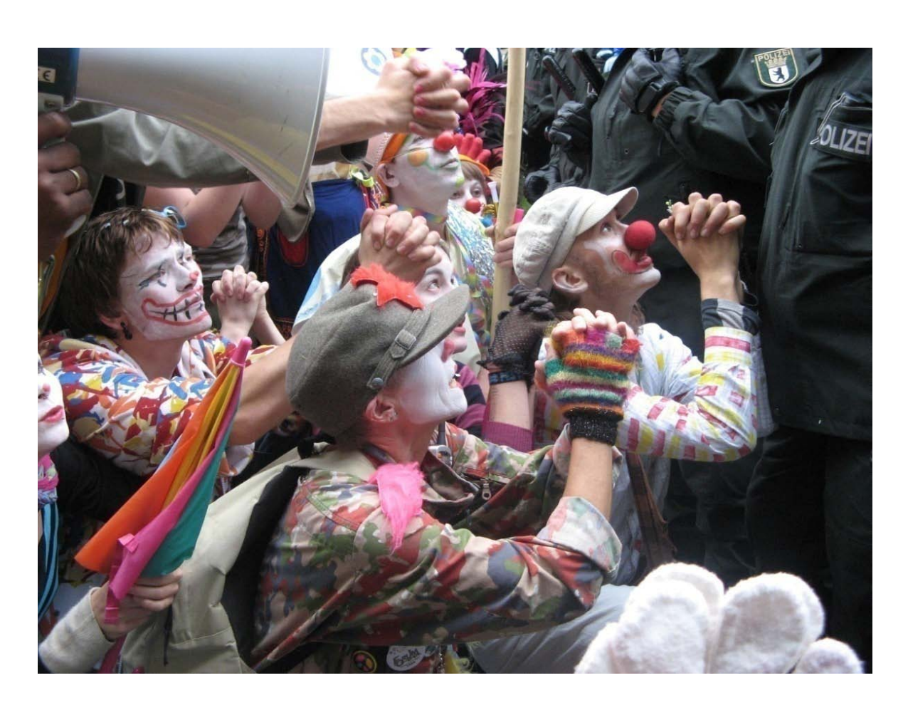
Figure 3. Clandestine Insurgent Rebel Clown Army

considerable number of functions (besides the decorative one). When it is intentional, excess can function as a critical/oppositional strategy directed against the status quo of the moment. This use of excess is as old as the need to transgress the official culture by disobeying its rules, canons and practices by the means of carnival, clowns and festivals.