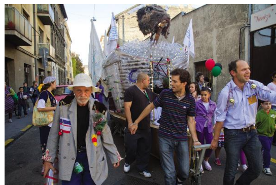
Figure 6. Performative walking with Mokus Maxi sculpture. Reprinted from 20 forintos

2013 from http://pneumaszov.org/20ft_eng/gallery.html