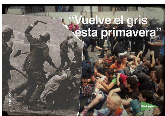
Figure 2. Grease strikes back this spring.