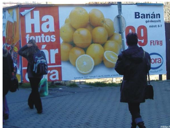
Figure 16. “Banana genetically modified”. Reprinted from Kétfarkú kutya hülyeség , Adapted

June 6, 2013 from http://www.bkvhatra.hu/modul.php?modul=cikk&cikk=819