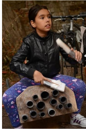
Figure 4. Girl playing a recycled instrument.