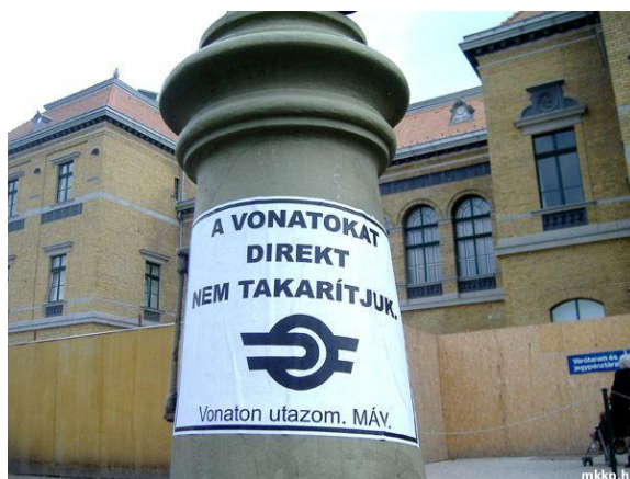
Figure 18. We intentionally do not clean the trains.

I travel by train. Hungarian State Railways. Figure 17. Reprinted from Kétfarkú kutyás hülyeség , Adapted June 6, 2013 from http://mkkp.hu/wordpress/?page_id=821