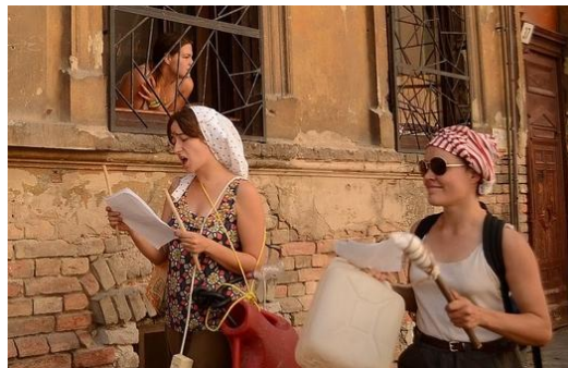
Figure 5. Performative walking.