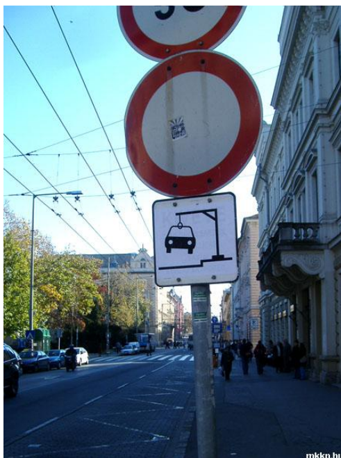
Figure 17. MKKP traffic sign. Reprinted from Kétfarkú kutyás hülyeség , Adapted June 6, 2013 from http://mkkp.hu/wordpress/?page_id=821