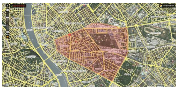
Figure 3. District VIII. Adapted from Wikimapia , n.d., Adapted June 6, 2013 from http://wikimapia.org/#lang=hu&lat=47.499576&lon=19.083252&z=13&m=b&show=/4266214/hu/