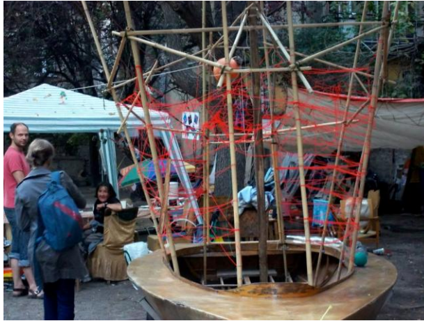
Figure 7. Mokus Maxi sculpture base, Reprinted from 20 forintos operett , 2012, Adapted June 6, 2013 from https://www.facebook.com/20ForintosOperett?fref=ts