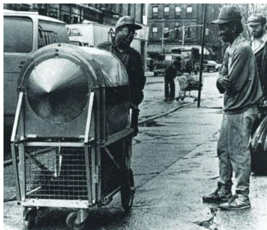
Figure 11. Krzysztof Wodiczko's Homeless vehicle project. Reprinted from Elisava TdD , by A. Figueres, 2010, Adapted June 6, 2013 from http://tdd.elisava.net/coleccion/12/figueres-es