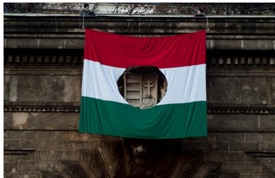
Figure 20. 4K! project in Clark Ádám tér.