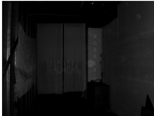
Figure 13. Viktor Markos' Eight Sea installation.