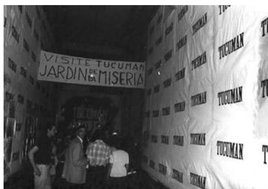
Figure 21. Tucuman Arde. Reprinted from Decir silencioso , by M. di Croce, 2012, Adapted June 6, 2013 from http://marthadicroce.blogspot.hu/2012/01/artistas-de-vanguardia-responden-con.html