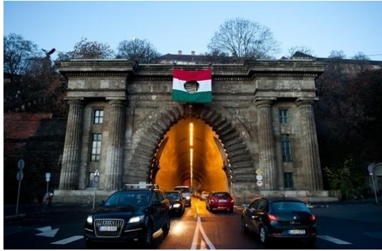
Figure 19. 4K! project in Clark Ádám tér.