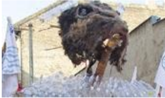
Figure 9. Mokus Maxi sculpture head. Reprinted from 20 forintos operett , 2012, Adapted June 6, 2013 from http://pneumaszov.org/20ft_eng/gallery.html