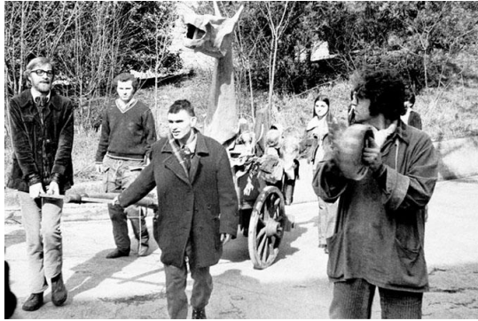
Figure 12. Marco Cavallo.