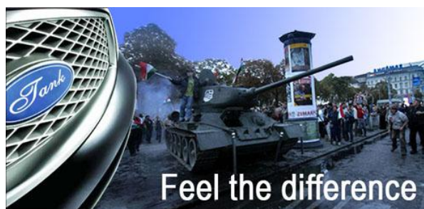
Figure 1. Activist collage of the Hungarian protests of 2006. Reprinted from Riots in Hungary , by Subba, 2006, Adapted June 16, 2013 from http://riotsinhungary.blog.hu/