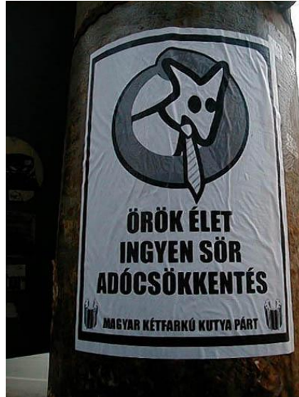
Figure 15. “Eternal life/Free beer/Tax cuts”. Reprinted from BKV hátra online , 2009, Adapted

June 6, 2013 from http://www.bkvhatra.hu/modul.php?modul=cikk&cikk=819