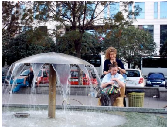
Figure 10. Hair cutting in Blaha Square.