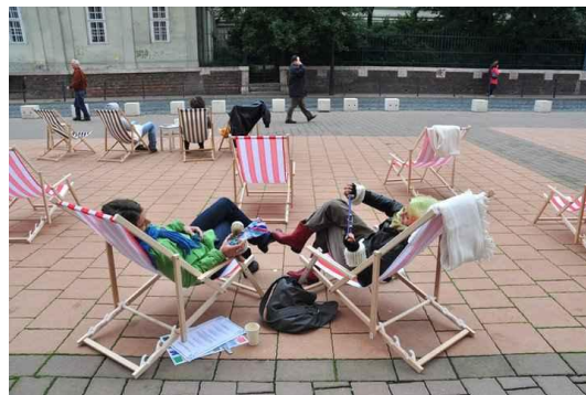
Figure 14. Városi szalon