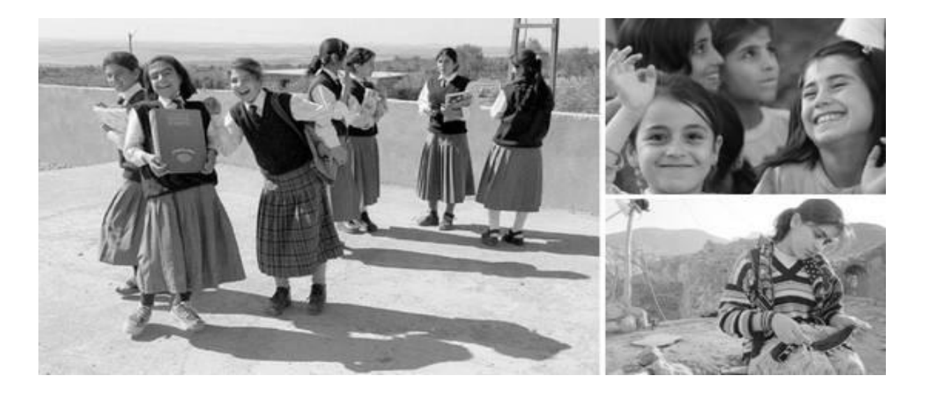
[Figure two: [CYDD school girls]. (n.d.)]

Identifying the programs' international ties and explicit capitalist interests by looking at funding resources is key to understanding some of the motives for the types of education that girls' are encourage to pursue. In one interview, a staff member from ÇYDD explained the