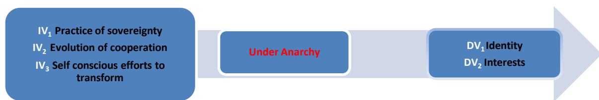
Figure 2: Wendt's Variables

Using this pattern as the backbone of analysis, Wendt treats state interest and identity as two separate dependent variables under the condition of anarchy in a self help world. For the sake of clarity, figure 2 has been constructed to showcase Wendt's framework. His framework presents three institutional transformations where identity and/or interests (DV 1 and DV 2 ) are transformed; by the practice of sovereignty (IV 1 ); by evolution of cooperation (IV 2 ) and by the intentional efforts of transformation (IV 3 ). 114