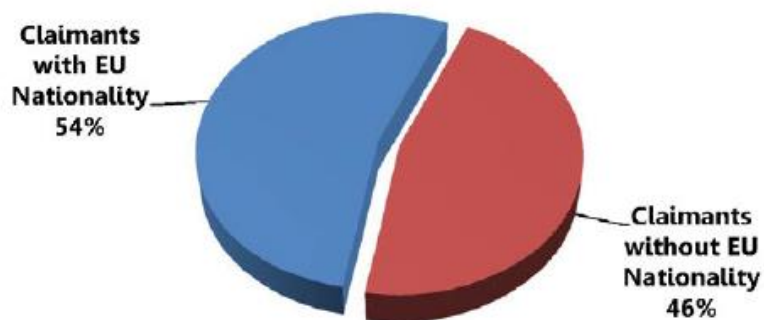
Figure 3 - Arbitration Claimant Nationality 104