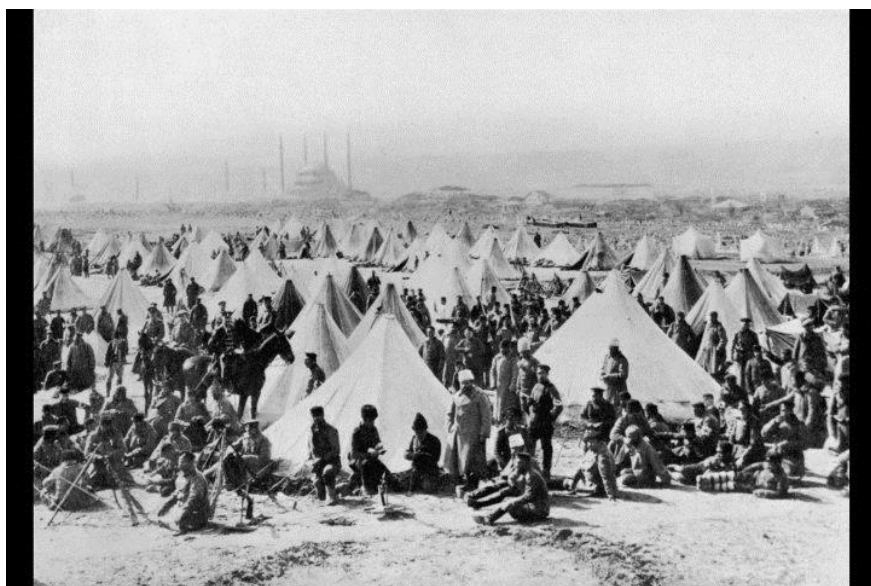
3) The besieged city of Adrianople