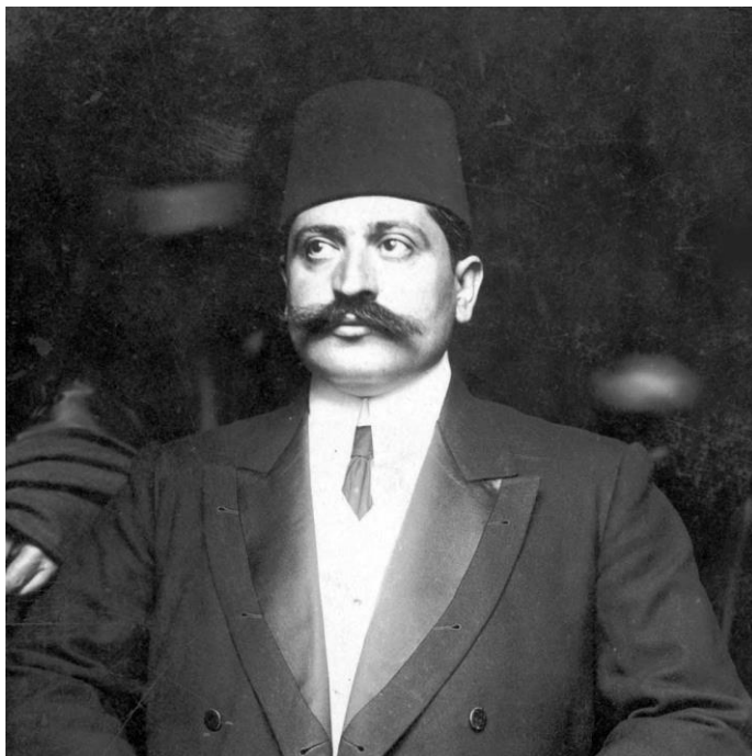
5) Mehmed Talat pasha