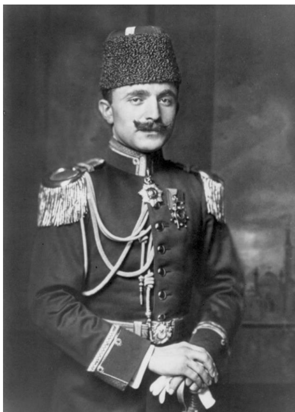
6) Enver pasha was suspected by the Carnegie Commission of being responsible for the atrocities (source: http://kids.britannica.com/comptons/art-141869/Enver-Pasha )