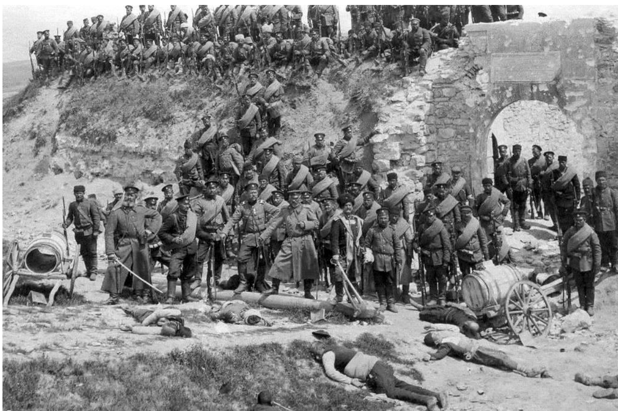
4) The Aivaz Baba fort of Adrianople conquered by the Bulgarians