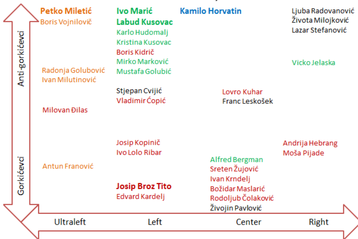
Figure 2. Factions in the KPJ from the fall of Gorkić until the end of 1940. The names of faction leaders are bolded. The names of those not involved in any factions are in black. The group around Ljuba Radovanović was composed of former disciples of Sima Marković, but none of them attempted to take over the KPJ.