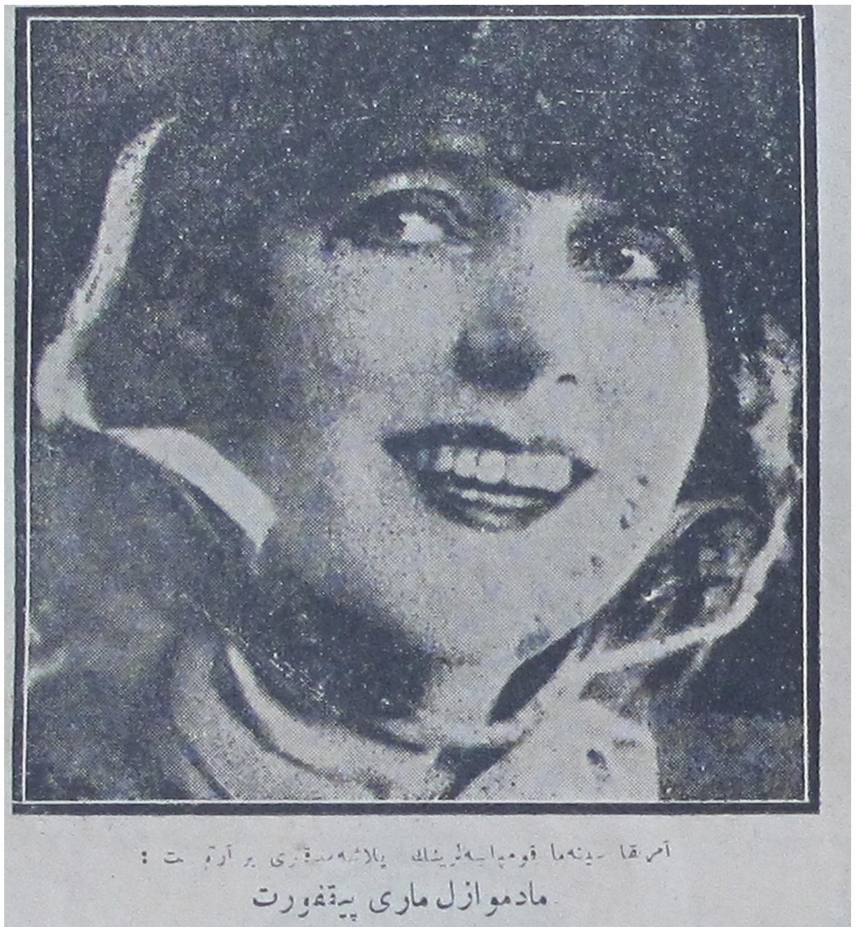
Figure 2: Ms. Mary Pickford in “Sinema Muhasebeleri (Cinema Accounts),” Yeni inci (The New Pearl) num. 3 (1 Agustus 1338) (1 August 1922), 9