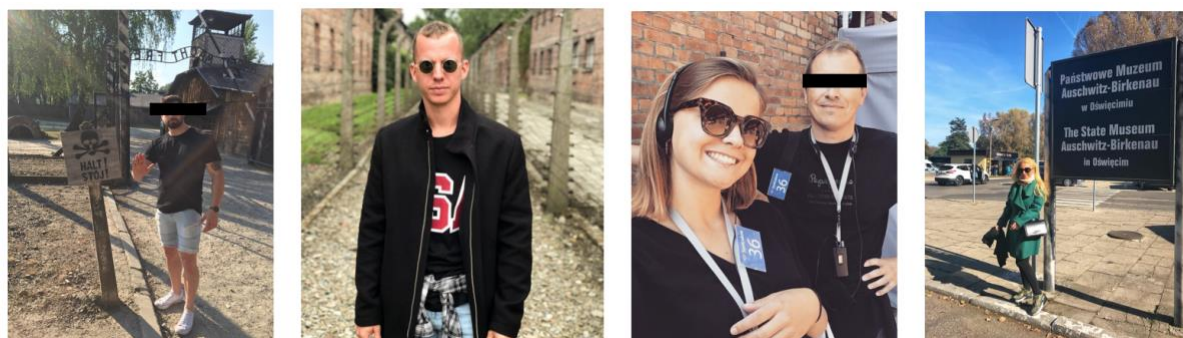
Figure 2: Examples of self-placement photographs 96

subject on their journey, they are merely informed that the tourist was in a particular place, at a particular time. These could be thought of as a typical ‘tourist photo’ where the subject is positioned in front of a visual landmark. In this respect, all of the self-portraits considered for this study are effectively self-placement photographs, as they communicate to an Instagram audience that the subject of the photograph is at Auschwitz Museum.