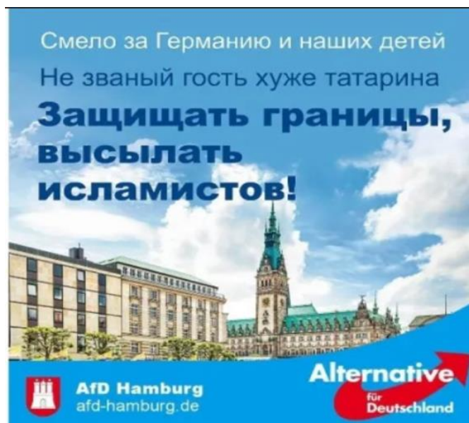
Figure 3. The AfD propaganda poster that was hanging in the streets of Hamburg, 2017 257

Although it is hard to estimate the actual number of Russian-Germans who voted for the AfD in the Bundestag elections of 2017, Dennies Spies provides quantitative and qualitative findings regarding the changing voting behaviours of the Russian-Germans, claiming that around 15-17 % of all Russian-speaking respondents at exit polls voted for the AfD. 258 The following section aims to consider how pro-AfD attitudes are reflected in the online discourse.