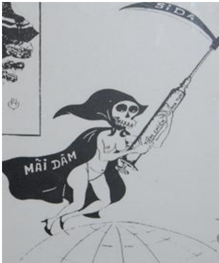
An old propaganda poster of a prostitute (mãi dâm). SIDA, the French acronym for AIDS was commonly used in the 1990s in Vietnam.

The movement also tried to influence and counter the more negative messages of government HIV prevention activities. In the 1990s and early 2000s, large numbers of Communist propaganda style billboards were erected around the country warning people of the dangers of HIV. These invariably focussed on drug use and sex work and equated these social evils with the HIV epidemic and death. The images were very dark and negative, even violent, showing blood soaked needles, death, etc. They relied on fear tactics to 'scare' people into moral behaviour and away from drugs, prostitution and thus AIDs (T. H. Khuat, Nguyen, and Ogden 2004; Giang and Huong 2008).