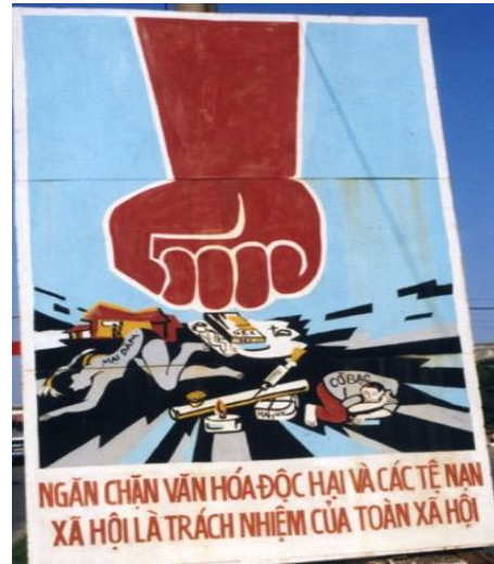
'Preventing harmful culture and social evils is the responsibility of the entire society'